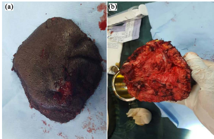
Figure 4. Excised mass for histopathology.