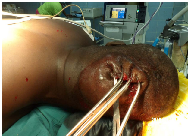
Figure 1. Intraoperative photo under anaesthesia showing the ruptured occipital scalp AV malformation with controlled bleeding sites.

day 12 as shown in Figure 5 . Estimated blood loss was approximately 500 mls for the initial emergency excision.