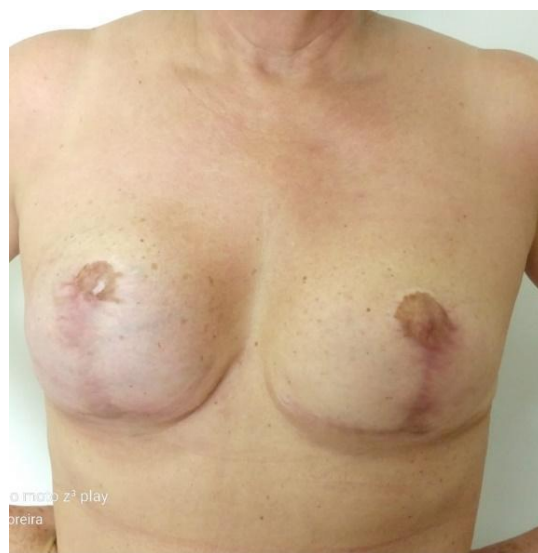
Figure 2. Image after the 12th session.