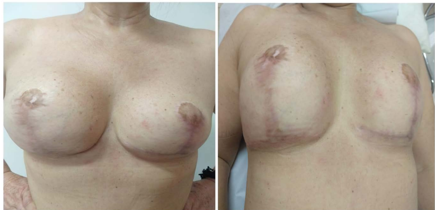
Figure 1. Image of the breasts before the first session.

The patient remains under monthly monitoring with the physiotherapist and the surgeon. In the follow-up, the patient remains without complaints of pain on palpation, and without signs of edema and stiffness in the right breast. The patient did not need to use medication during treatment and also did not need a new surgical intervention. Figure 1 shows the breasts before treatment, with complaints of pain on palpation, swelling, and stiffness in the right breast. After the start of treatment, the patient presented remission of signs and symptoms at the fourth session. And there was an improvement in the overall condition at the 12th visit, as shown in Figure 2 . Figure 3 shows the image 30 days after treatment, with no complaints of pain and stiffness in the right breast.