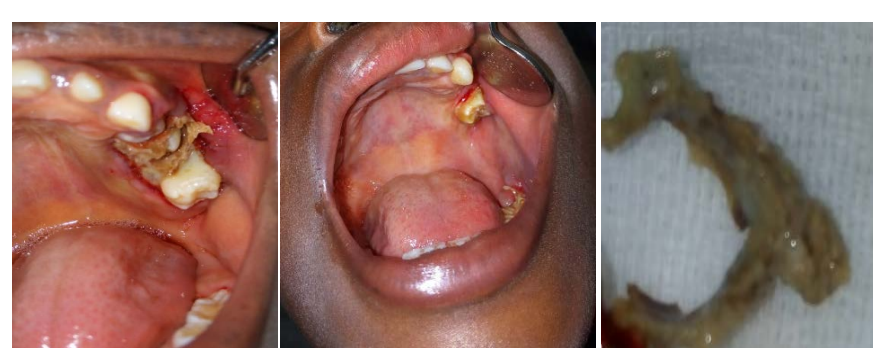
Clinical view before surgery