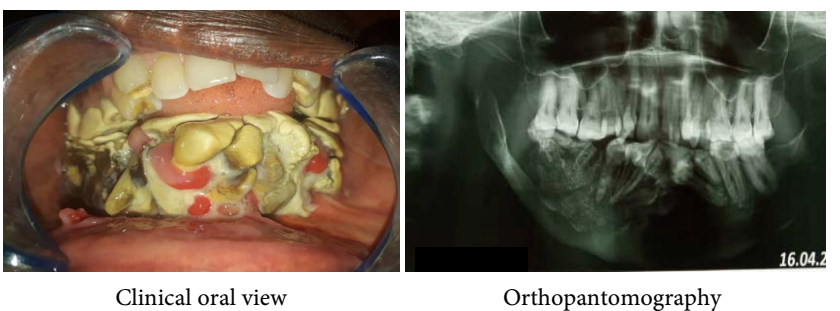
Clinical oral view