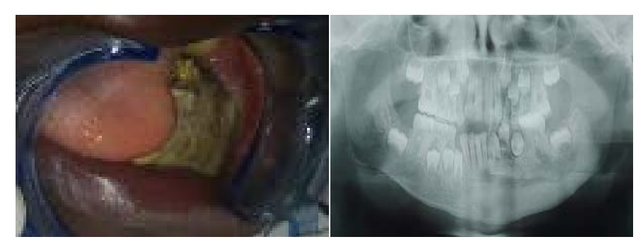
Clinical oral view