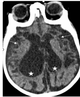
Figure 2. Cranioencephalic CT axial section, without iodinated contrast injection, showing biventricular hydrocephalus (stars), with cerebral atrophy predominating in the temporal regions (arrows).