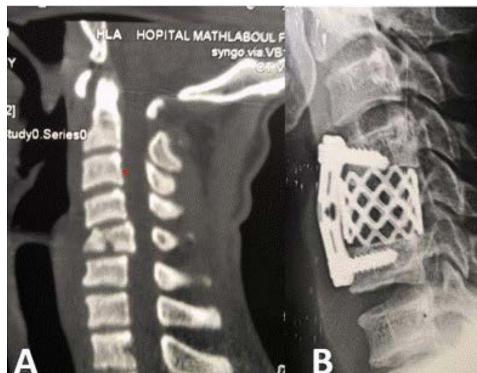
Figure 2. (A): Préop imaging: C5 body fracture. (B): Postop imaging: corporectomy + Plating with screw + Pyramesh cage.

Medical treatment was corticosteroids in 42%, analgesic and antibiotic prophylaxis in all case.