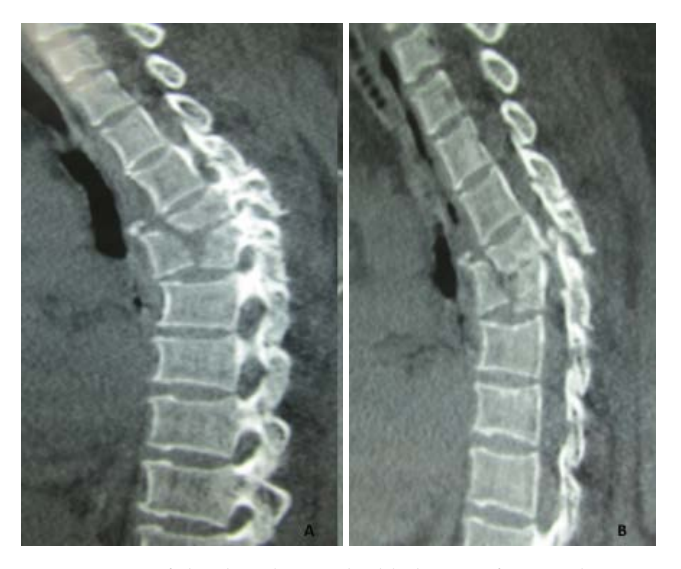
Figure 1. CT of the dorsal spine highlighting a fracture-bursting of T4 and T5, posterior distraction and translation.

Type C fractures are subdivided into 3 categories: C1, represented by type A fractures with rotational force associated, C2, type B fractures with rotational force associated and C3, represented by purely rotational injuries.