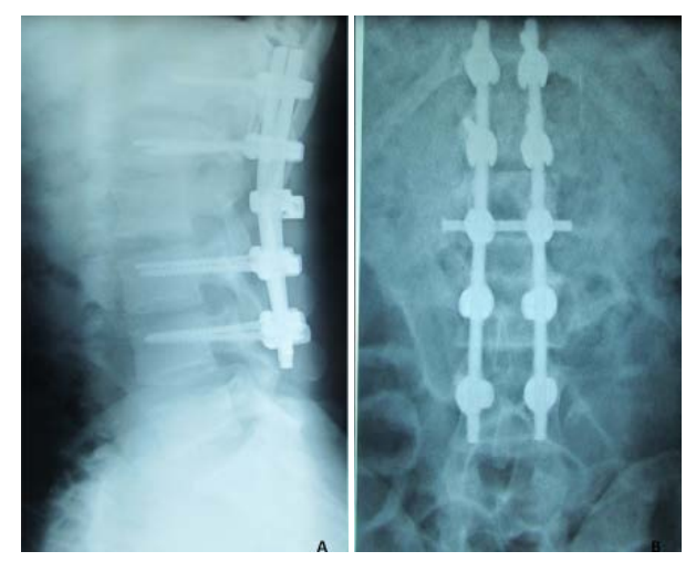
Figure 5. Post-osteosynthesis control x-ray in face incidence (A) and profil (B).