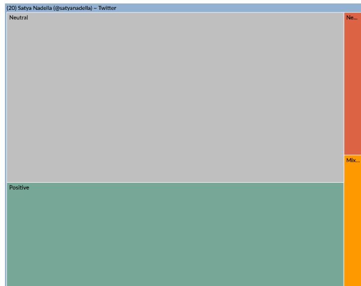
Figure 6. Sentiment analysis of Tweets #SatyaNadella. (Exported from QRS NVivo Qualitative Software on January 2, 2021).