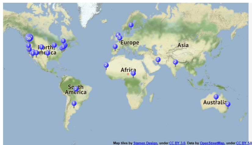
Figure 4. World Map of tweets #SatyaNadella. (Exported from QRS NVivo Qualitative Software on January 2, 2021).

The Sociogram Twitter in Figure 5 depicts the network of tweets and retweets obtained using the NVivo analytical tool. The sociogram appears to be like a ball which specifies that the retweets on the tweets of #SatyaNadella were immensely spread like a web across the globe. Hence, the importance of examining Nadella's leadership traits in one of the most successful IT giants "Microsoft" is of immense importance. The leaders can learn a lot from Nadella's journey and personality as he is the first in the "Best CEOs for Diversity 2020" (Comparably, 2020).