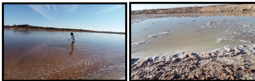
Figure 2. Sampling site.