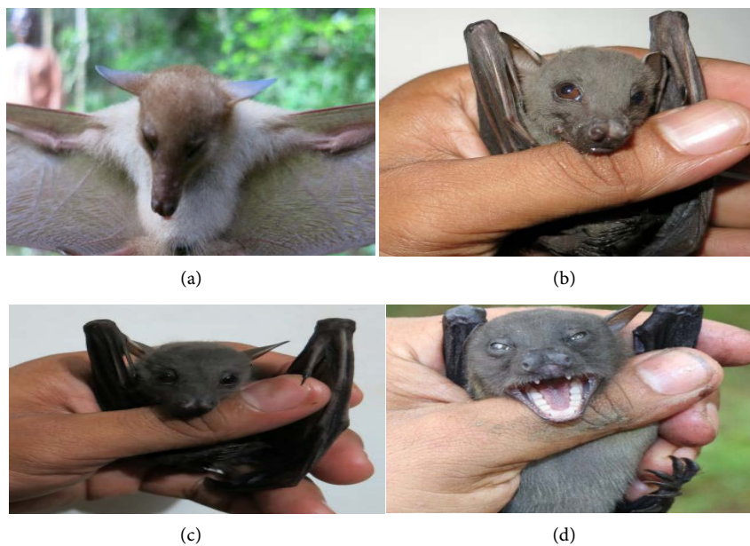
Figure 2. Species of Chiropteran found in I. fagifer forest (locally known as Kayam Forest). (a) C. brachyotis , (b) M. minimus , (c) P.jagori , (d) P. minor .