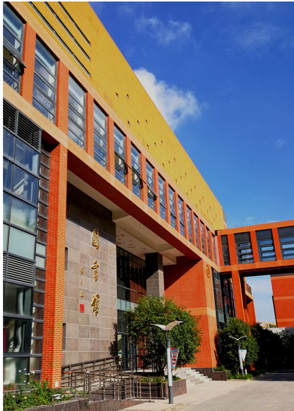
Picture 1. Xuhui campus library.