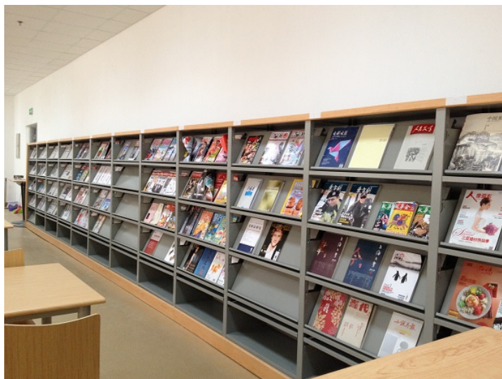
Picture 3. Xuhui campus periodical room.

Based on information technology and innovative service concept, the new library space, is a new type of library space, such as learning space, creative space, leisure space and experience space [4]. It is a new type of library space for traditional libraries and a positive extension of the concept of space creation.