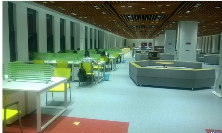
Picture 5. Library of Nanjing university of aeronautics and astronautics.