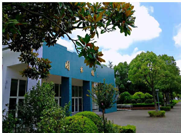
Picture 2. Pudong campus library.

type, space facilities and space service reconstruction.