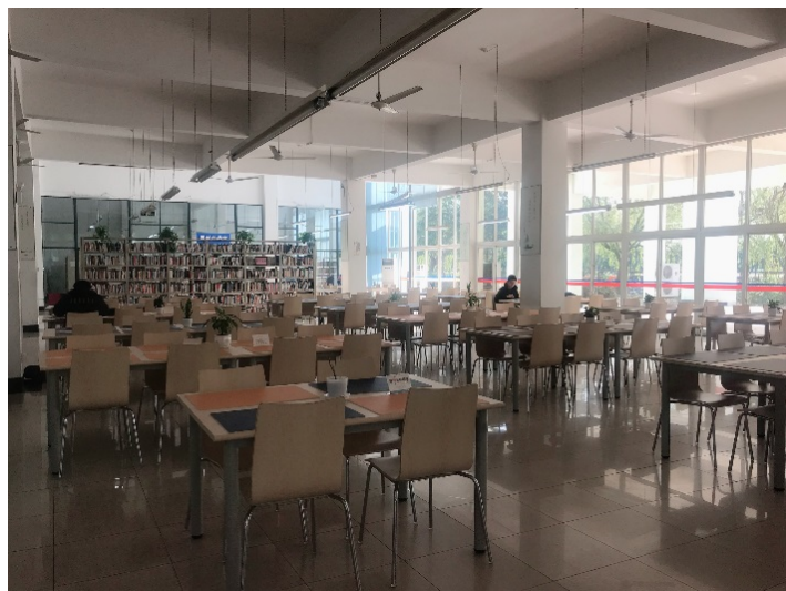
Picture 4. Pudong campus self-study area.

The new space of our library can be divided into education space, electronic reading area, mobile service space, exhibition space and entertainment space. Libraries in Picture 5 and Picture 6 respectively show the new library space.