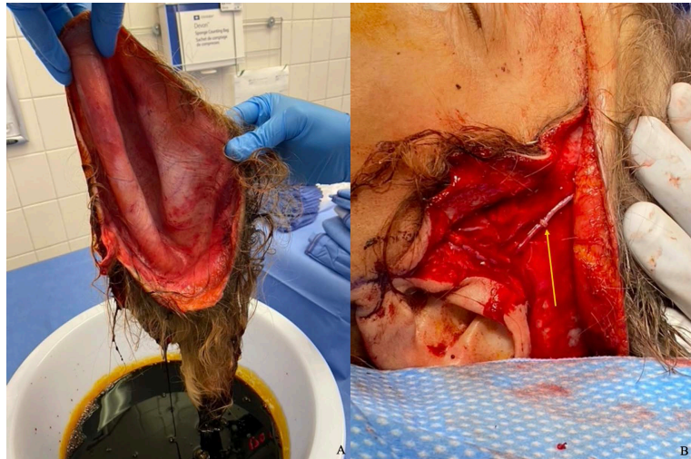
Figure 1. (A) Avulsed scalp prior to replantation; (B) Scalp replantation demonstrating a venous anastomosis with a venous coupler (yellow arrow).