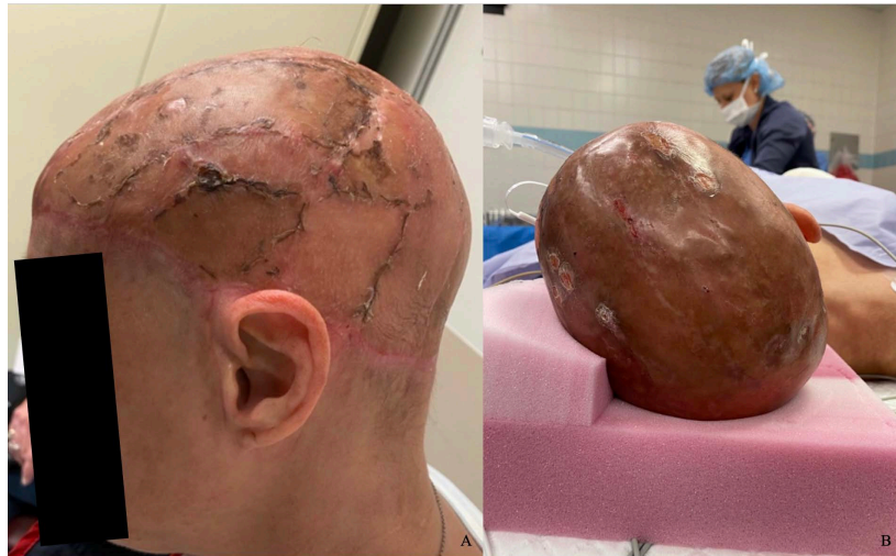
Figure 4. (A) 4 weeks status post split-thickness skin graft placement with sutures still in place; (B) 13 weeks status post split-thickness skin grafts demonstrating a healed scalp. Presenting for small full-thickness skin graft placement.