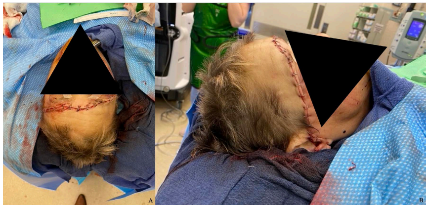
Figure 2. (A) Anterior view status post scalp replantation; (B) Right lateral view status post scalp replantation.