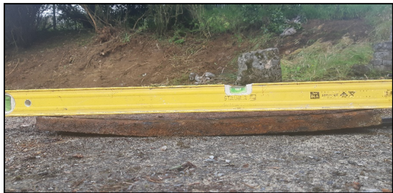
Figure 5. H1 F1 galvanized steel cover rusted and deflected.