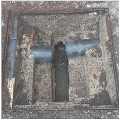
Figure 3. First chamber at the first house surveyed (H1 F1).

to be used. Circa 21% of the AJs/chambers and their covers were in poor condition. For example, Figures 3-5 are from the first chamber at the first house surveyed. Figure 3 shows the chamber with the cover removed. This chamber had standing water with the next downstream chamber having no standing water. A check on the invert levels showed a back fall of 0.026 m between the invert level of both chambers. The cover frame is out of alignment as is the cover which can be seen in Figure 4 and Figure 5 . It should be noted that there were chambers in considerably poorer condition. This led to actions that had to be taken including replacing nine covers where the existing covers could not be seated back into the