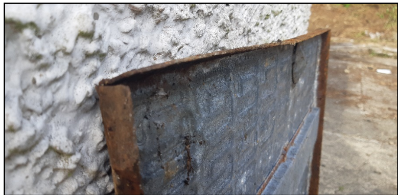
Figure 4. H1 F1 galvanized steel cover with damaged flange.