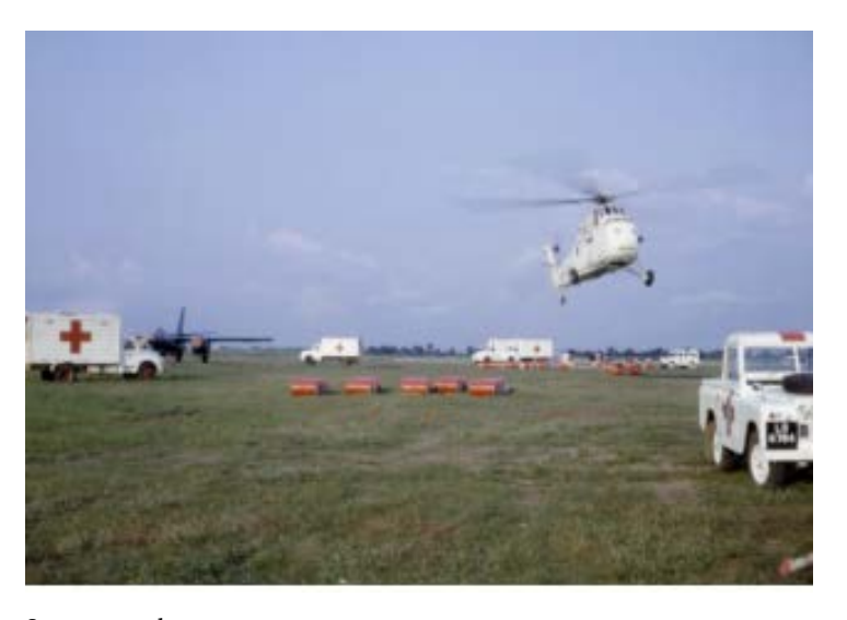
Appendice 4: Biafra Emergency Constructed Airport at Uli