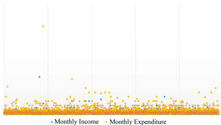
Figure 1. Monthly income and expenditure of the whole family.