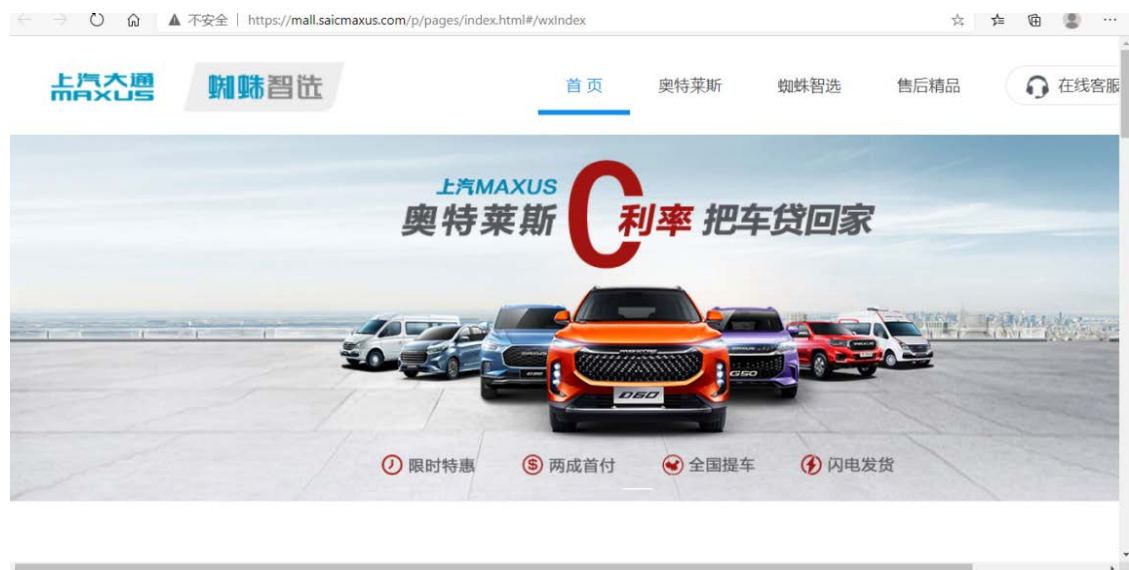
Figure 2. Home page of “Spider Smart Selection” platform.