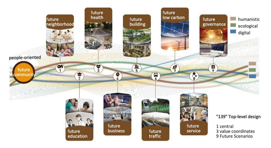
Figure 1. "139" top-level design of Zhejiang future community.

build future neighborhoods, education, health, entrepreneurship, the nine scenarios of construction, transportation, low-carbon, service and governance create new urban functional units with a sense of belonging, comfort and future.