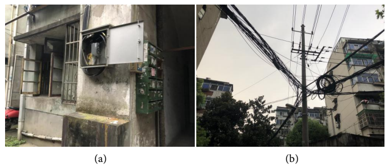
Figure 5. Bare electrical accessories and messy cables.

There are various problems in such communities, which affect the quality of life of residents and the image of the city, but they can do two things with one