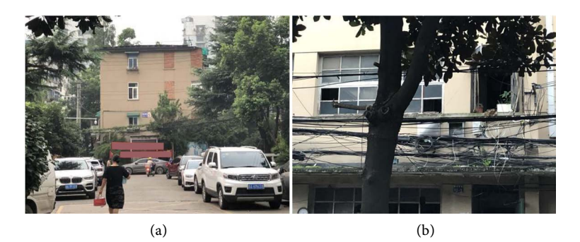
Figure 3. Dilapidated building facade and abandoned public green space.