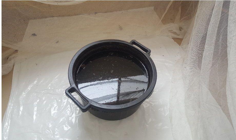
Figure 2. Showing Mosquitoes breeding vessel within the setup.