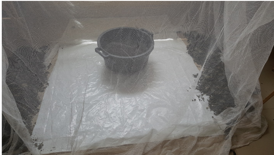
Figure 3. Main experiment with the test plant ( Hyptis suaveolens ).

(i.e. fresh and dried portion) of Hyptis suaveolens . The % Mortality Rate (MR) of mosquitoes at each Experimental unit was determined using standard procedures by [15].