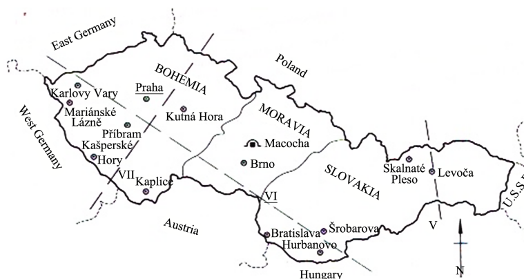
Figure 1. Map of Czechoslovakia in 1971 showing sites of field excursions. Translation: Praha-Prague; Karlovy Vary-Carlsbad; Mariánské Lázně-Marienbad.

As noted above, my exchange visit was in August and September 1971, three years after Alexander Dubček introduced the reforms of the Prague Spring [a period of political liberalization and mass protest in the Czechoslovak Socialist Republic]. In August 1968, the Soviet Union and other Warsaw Pact members invaded the country to suppress the reforms. During my visit, it was still possible to see bullet holes in the National Museum at the top of Václavské náměstí [Wenceslas Square] and the damage to the statue of national patron St. Wenceslas ( Figure 2 ).