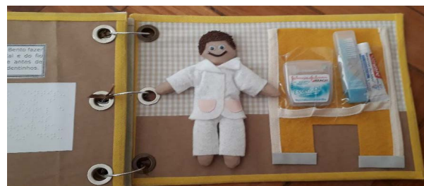
Figure 4. Illustrations showing the dentist with toothpaste, a toothbrush, and dental floss.