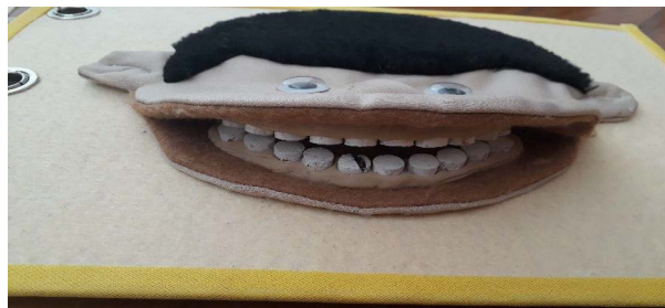
Figure 3. Illustrations of Bento's face showing the caries.