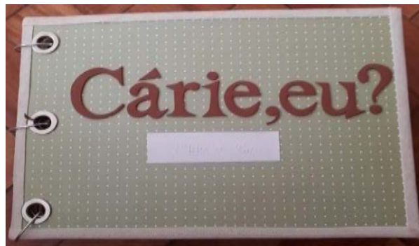
Figure 1. Cover of the book Caries, Who me? (Cárie, eu? in portuguese).