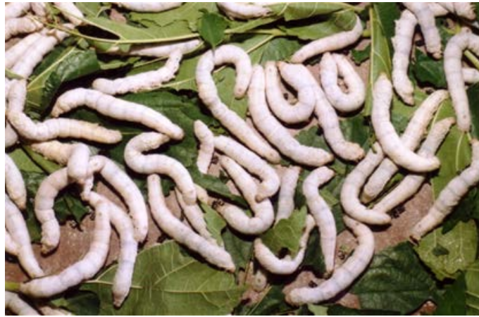
Figure 3. Silkworms reared on M_5 mutant mulberry leaves in M_2 generation.