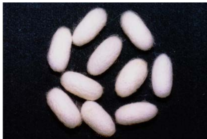
Figure 4. Cocoons recovered from silkworms reared on M_5 mutant mulberry leaves in M_2 generation.

weight protein [45]. Mulberry leaves are rich source of proteins, carbohydrates, total chlorophyll and total carotenoids, ascorbic acid and mineral elements [46] [47]. Deficiency of certain nutrients or an imbalance of nutrients in leaves cause changes in the composition or metabolic activity of silkworms [48] [49]. Carbohydrates, proteins and lipids play an important role in the biochemical process underlying growth and development of insects [50] [51]. Total soluble sugars exist in the form of water soluble carbohydrate and are vital for carbohydrate metabolism. Sugar content in mulberry leaves is closely related to silkworms health. Mulberry leaves with high sugar content field's good rearing results [52] [53] [54]. Total soluble sugars exert a positive role in the alleviation of imposed stress via osmotic adjustment in plants [55]. Gamma irradiation induces several changes and cells in order to prevent structural proteins and to maintain membrane phospholipids in liquid crystalline phase, soluble sugar accumulate in the stressed cell [56]. Due to lower dosage of gamma irradiation, total soluble sugars significantly changed and the behaviour denotes increasing osmoprotectants may come as defensive mechanism caused by the pre exposing gamma rays