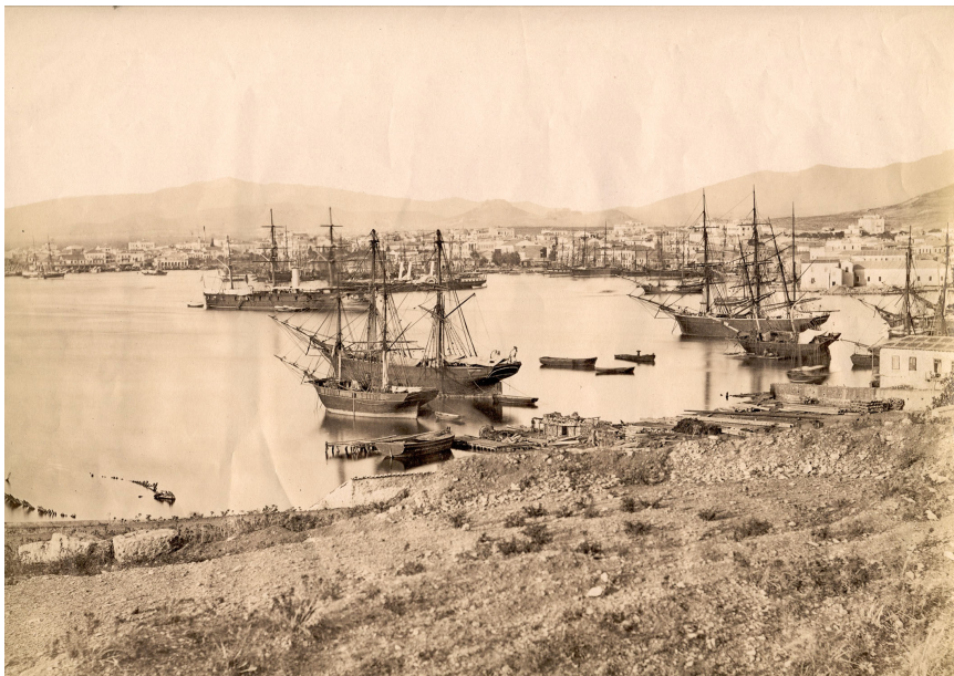
Figure 4. Piraeus, general view of the city.

Despite state ambitions, changes in the cities during the first decades after the creation of the new Hellenic state took place slowly. Urban transformations evolved slowly until about 1880, owing to the survival of pre-revolutionary models and the isolation of regions, owing to the lack of a communications network. Most settlements during this period were thus isolated and introverted, linked among themselves mainly through trade fairs, which sometimes coincided with local religious feasts. The image of the settlements reflected the geopolitical reality that they represented: the settlements of the Peloponnese, Roumeli or the Cyclades during the early decades after the creation of the new state were characterized by their local features, according to the conditions under which they were created. Their gradual change led to the uniformity desired by the state.