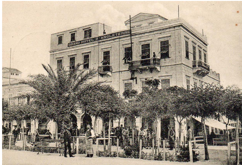
Figure 2. The modern face of newly-built Ermoupoli, Syros. The “England Hotel”.

significant linchpin of economic development, with investments in the land and real estate market that made it a strong competitor of industrial investments. The channeling of significant investment capital into the urban land market and into buildings by omogeneis , 12 by local merchants, (who invested their profits from the sale of raisins), by high-ranking employees and by wealthy villagers was typical. Significant capital was invested in building houses in Athens by omogeneis and foreign residents who chose the new capital as their home. The image of the private houses confirms that their owners had significant funds and aimed for high aesthetics and construction value. The presence of their homes was intended to ensure their advancement in the society. Virtually all such homes, both in the capital and in other cities, were built with private funds. The state had a very limited participation in the re-construction. The improvement works covered the state’s weakness regarding the amount owed to financial difficulties: both the magnificent buildings for public use in Athens (Kasimati, 2010; Kasimati & Panetsos, 2014) and those for similar use in the regional cities (hospitals, schools) were built with contributions from benefactors, almost always in the neoclassical style (Biris & Kardamitsi-Adami, 2004).