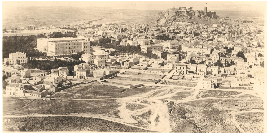
Figure 3. General view of Athens, from Lycabettus hill, in about 1874. In front is the new section of the city with straight streets and new buildings. The palace of Otto is dominant on the left.