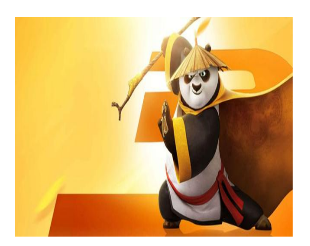
Figure 16. Image of A Bao in Kung Fu Panda.

and orderly moral norms, and his pursuit of personal liberation and his realization of personal dreams could exist along with his defects and fears (Yu, 2017: p. 134).