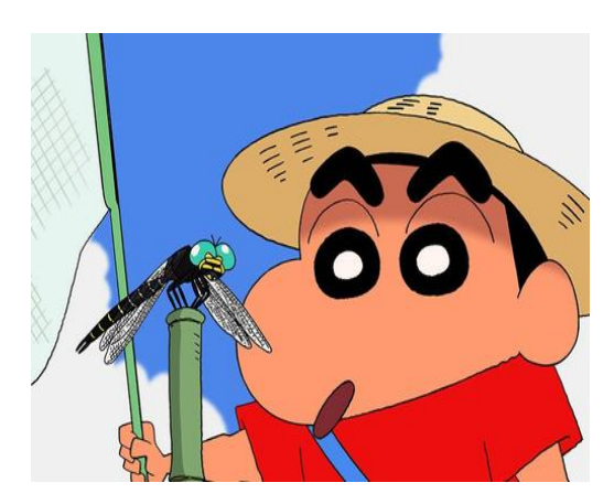
Figure 10. Crayon Shin-Chan.