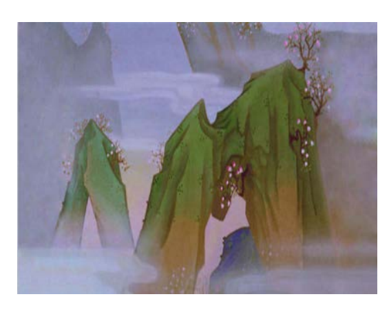
Figure 3. Huaguo mountain.