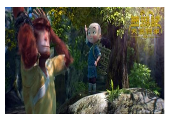
Figure 15. Images of Sun Wukong in the Monkey King.