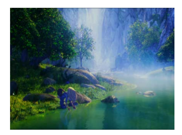
Figure 7. Jungles.