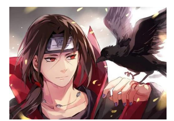
Figure 11. Naruto of Japanese anime.