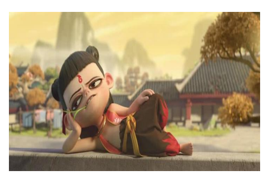
Figure 13. The use of grey wall and green grasses in Nezha.