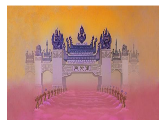
Figure 5. Haven-based palace in Uproar in Heaven (Source: <a href="https://image.baidu.com">https://image.baidu.com</a>).

While the space of the scene of the Monkey King : Hero is Back covered not only mainland landscapes such as caves (see Figure 6 ), jungles (see Figure 7 ) and buildings, but also contained different sub-visions. For instance, the buildings in the film included not only various urban styles like inns, but also mountain temples (see Figure 8 ), and they could be seen as the sub-scenes. In fact, there were more than 90 scenes in the film, followed by constantly accumulated events, thus, the entire space was three-dimensional, and was constantly changing as well (Xie, 2017: p. 105).