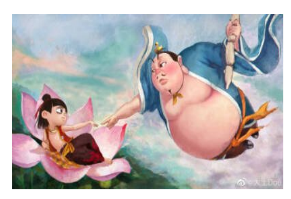
Figure 14. The use of Chinese brush in Nezha : I am the Destiny.

In this sense, the design of two Chinese animations paid more attention to the expression of the characters, the matching degree between characters and stories, along with their respective sceneries-corresponding.