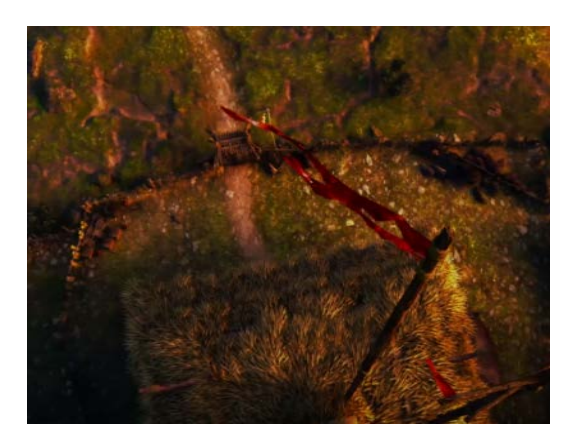
Figure 6. Caves.