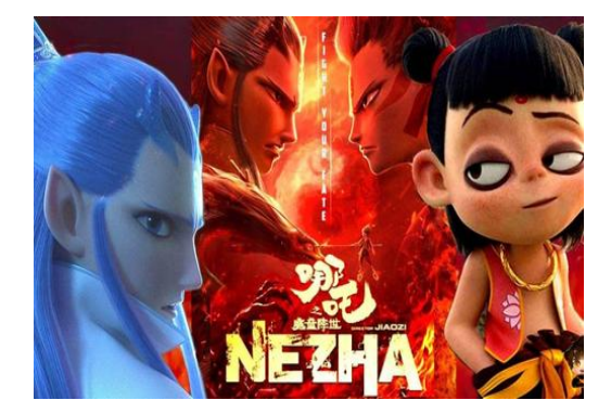
Figure 12. Image of Nezha.