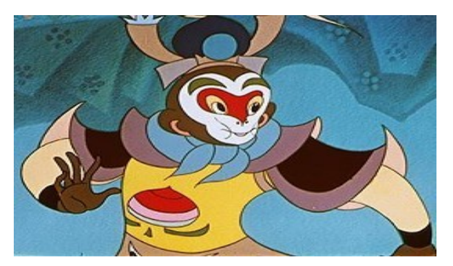
Figure 1. Image of Sun Wukong in Uproar in Heaven.

The different part also embodied in the background or environment combining with the character, and the term "hero" in this sense was constructed by the impression of the space and the narrative forms. The setting of the space of the Uproar in Heaven was based on the Huaguo Mountain (see Figure 3 ), the dragon palace (see Figure 4 ) and a few haven-based palaces (see Figure 5 ) in that Meishupian . The story unfolded in the constant appearance of such places where the decorative background of the traditional Chinese expressions was in a way of repetition and limitation. In other words, the heavens and the human world mainly served as the place where the story took place.