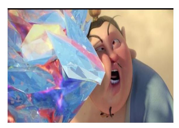
Figure 17. Image of Tai Yi in Nezha.

the box office showed that, the two works were capably competing with American cartoons and Japanese anime. They definitely opened a bridge between the Chinese animation industry and the rest of the world.