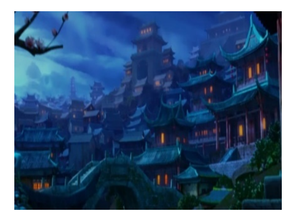
Figure 8. Mountain temples in the Monkey King: Hero Is Back.

The third is about the artistic performance. Roles of the Uproar in Heaven were designed by the staged form of Peking Opera. The narrative expressions were mainly embodied by the performance of the characters. Though, due to a lack of the multi-model spaces, there was very little communication or interaction between the characters and scenes. However, in the Monkey King: Hero is Back , due to the benefits of the digital technology and its dynamic spaces, for instance, the scene of the eaves, balconies, even the stone lions, etc. had become an