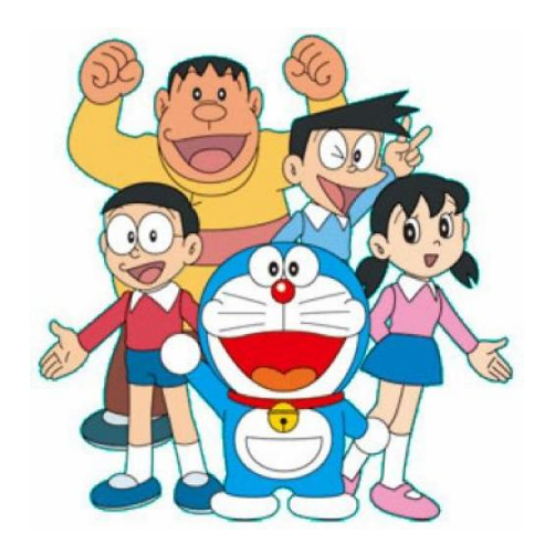
Figure 9. Doraemon.

While China's animation works appear to be different. In Nezha: I Am the Destiny , the design of Nezha was rather ugly (see Figure 12 ), corresponding to his grievous, rebellious and non-yielded characteristics. The use of Chinese style of watercolor painting art form, grey wall and green grasses (see Figure 13 ) in the process of character-shaping also had a strong cultural function. Meanwhile the use of the Chinese brush (see Figure 14 ) waved between the heavens and the earth, embodying oriental aesthetic philosophy, though, in a short lens.