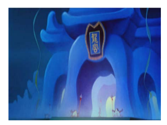
Figure 4. Dragon palace.