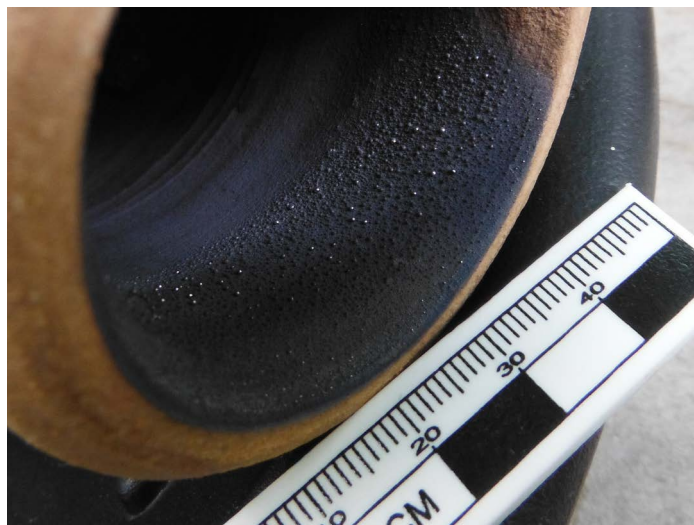
Figure 8. Mercury droplets in black mercury-rich residue along rim of ceramic retort. This black sooty residue in the retorts at New Almaden was scraped and removed to obtain additional mercury (Boulland & Boudreault, 2006).