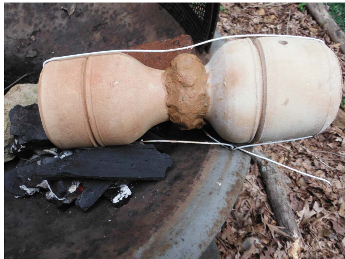
Figure 7. Retort in place with charcoal fuel (~600°F).