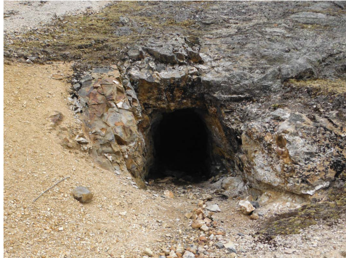
Figure 3. Mine entrance at Chonta, note vertical structure to right of entry.