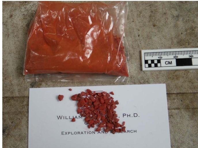
Figure 5. Cinnabar ore (~50 g).