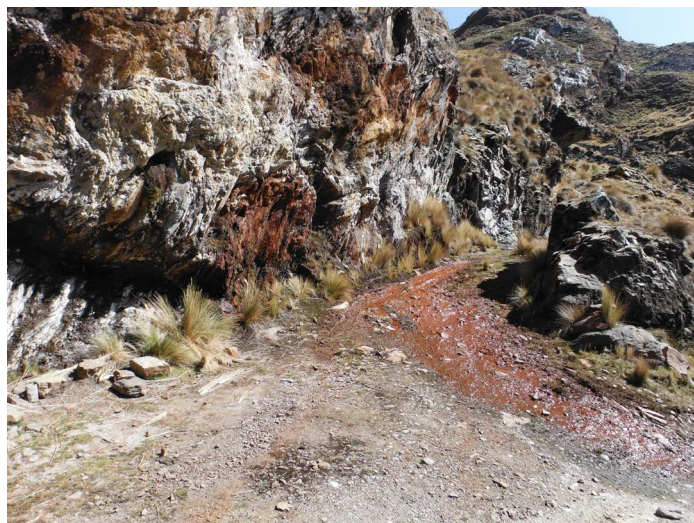
Figure 2. Samples of cinnabar were taken at northeast-trending fault along road that parallels Lago Pelagatos.

Chonta/Huallaca/Queropalca (4) site visit —The Chonta and Queropalca occurrences (Garbín, 1904; Giles, undated) may be accessed by a well-marked dirt road from Huallanca, to La Unión, and Baños. These occurrences were supposedly discovered upon orders from Spain in 1756 to find new sources of mercury to be used for Colonial silver amalgamation. However, it is very likely that these cinnabar-mercury occurrences were first known to pre-Inca people as a source of pigment as well as native mercury—early use of cinnabar as a red pigment by the Ohlone people in California led to the “discovery” of the New Almaden mercury mines in California by Spanish explorers (Lanyon & Bulmore, 1967; Boulland & Boudreault, 2006).