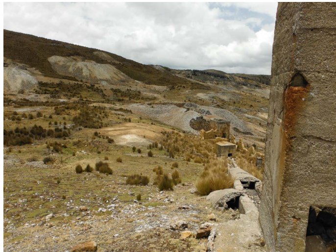
Figure 4. Buildings and tailings at Chonta, ground chimney and stack to right.

Samples from Chonta for this reconnaissance contained > 1000 ppm mercury; 10 - 199 ppm silver; 84 - 6391 ppm arsenic; 21 - 367 ppm antimony, and 31 - 9503 ppm zinc. Gold values are 0.01 - 0.07 ppm, but may increase with depth ( Table 1 ). These elements are all above background and indicate further study focused on silver and gold in association with mercury (Turekian & Wedepohl, 1961; Noble & Vidal, 1990). Specifically, the high arsenic is a pathfinder for gold and the high mercury content is an indicator of lead-zinc-silver ore (Rose et al., 1979).