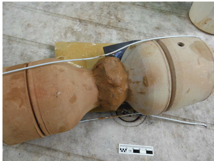
Figure 6. Double-ceramic retort with clay seal, vent to right.