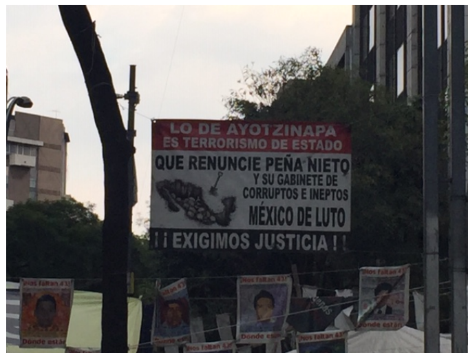
Figure 1. Renunciate Peña Nieto.

cula. According to cellular reportage at an airport hangar with the Attorney General and parents of the disappeared, the students were covered with layers of rocks, rubber tires, and firewood. “Like on a griddle”, one of the accused testified. The “griddle” was then soaked with diesel and gasoline and burned for fifteen hours from midnight until 2 p.m. the next day on September 27 (Vice, 2014). The bodily remains were collected and put into black plastic bags and tossed into the river near the San Juan Bridge. Parents, human rights activists, and artists, however, continue to refuse this rendition of the historical event and want conclusive proof. The University of Innsbruck in Austria has identified only the corpse remains from two of the Ayotzinapa students. Several protests ensued targeting sitting president Enrique Peña Nieto and his administration’s collusion with drug cartels, and failure to find the missing 43. “Renuncia Peña Nieto”, “Fuera Peña”, “Fuel el Estado”, “Mas de 28 Desaparecidos” (Figures 1-4) became some of the narrative frames that phygital graffiti Droncita artists employed to take up cargo (charge) and bear aesthetic witness and aesthetic post-witness to the disappearance of the 43.