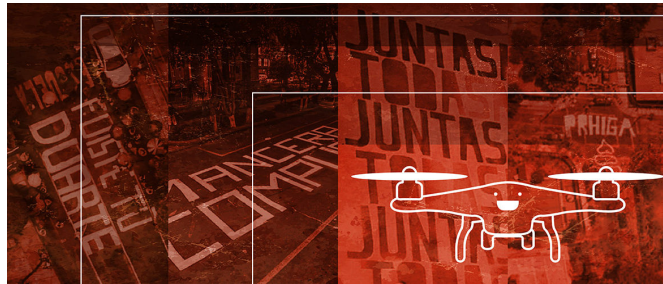
Figure 4. Droncita figure drawing.

the student movement # YoSoy132 that arose to oppose the candidacy of Peña Nieto and denounce the giant broadcast Televisa for its biased coverage. Responding to the age of surveillance technology, Compañeros de Droncita reproduced its “hegemonic power and reacts to its political environment”, through its performances (Duncombe, 2016: p. 433). In one of its major activist art performances, Rexiste equips its drones with spray cans and obliterates a portrait of Peña Nieto throughout Mexico City. Rexiste operates within an aesthetic politics of spectacle and disruption enabling individuals to collectively participate in a public discursive display (Rancière, 2004: p. 12).