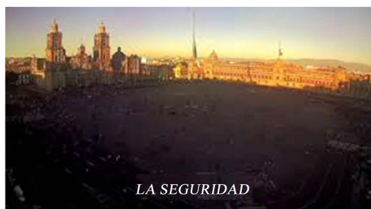
Figure 7. Image taken from Drone above the Zocalo.

At 18:19 hrs on October 2, 2015, ten minutes after the start of the meeting led by Committee 68 and the Ayotzinapa families, the government began broadcasting an audio from loudspeakers placed in the National Palace (Figure 7). At 18:45 while the police were advancing an excessive operation, in social networks, thousands of bots were replicating the message “March October 2: Firecrackers and objects are thrown at the National Palace, deploying anti-riot.” Ten minutes later, at 18:55, the Zócalo was empty. The audio kept sounding. What are they hiding? A year after the disappearance of the normalistas, in just fifteen days, two multitudinous demonstrations have claimed the responsibility of the Army. The truth cannot disappear. The Army must be accountable. #Desencuartelen La Verdad (Rexiste, 2015b).