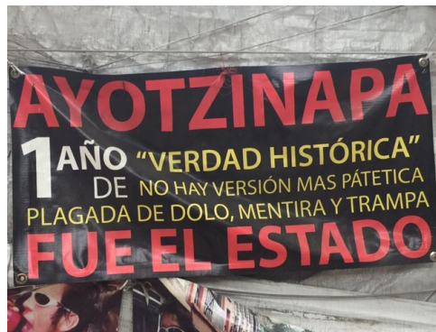
Figure 2. It was the state. Sign in Mexico City.