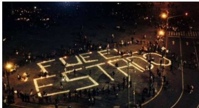
Figure 5. Fue El Estado. It was the state.

political power, the artists have physically taken over the time and space as a means to disturb the public sphere, disrupt the dominant discourse and shame the government (Critical Art Ensemble (CAE), 1996; Groys, 2014; Mouffe, 2007; Tufekci, 2017). The Rexiste drone videographer records the event and locality in real time, as it is physically inhabited. The content and “locality” is then sent across the Internet to form “glocalities” of “interconnections” that transmit the experience of the local (Meyrowitz, 2005). Hack the Power constructs virtual “glocalities” that are “primarily relational and contextual, rather than as scalar or spatial”, as they constitute “a series of links between the sense of social immediacy, the technologies of interactivity and the relativity of contexts” (Appadurai, 1996: p. 178). The glocality emerges as a space of shared consciousness in which members engage in a network of “texts, images, interpretative frameworks and horizons of experience” (St. Amant, Sapienza, & Sides, 2017: p. 19).