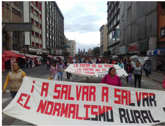
Figure 8. Save the rural normalism.

The camera pans to the next banner as seen in Figure 8 : “A Salvar Normalismo Rural” (Rexiste, 2015b: p. 20, 35; Save Rural Normalism). The crowd continues to shout, the numbers jumping to “trece, catorce, quince” (thirteen, fourteen, fifteen).