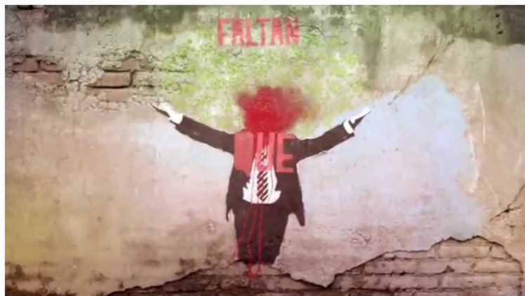
Figure 6. Bloodied image of Nieto.