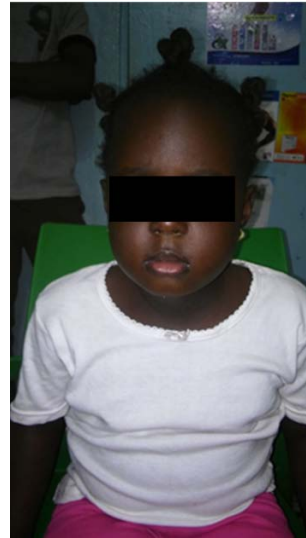
Figure 3. Photograph taken after 2 weeks of conservative treatment showing normal head posture.