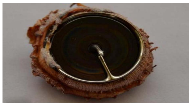
Figure 2. Shows that the prosthetic mitral mechanical valve after removing from the heart.

Abildgaard et al. have reported an incidence of thromboembolic complications of 7.1% in pregnant women with mechanical heart valve who were anticoagulated with LMWH during the entire pregnancy; 3.6% (0.6% - 13.4%) for LMWH during first trimester and warfarin in the following two, and 2.4% (1.1 - 5.2) for nine months oral anticoagulant [5]. Given the high teratogenic risk of oral anticoagulant and the elevated rate of miscarriages associated to warfarine derivatives in the first trimester of pregnancy, these drugs should be only used in cases at a very high risk of thromboembolic events, leaving LMWH the first option for anticoagulation of MPHV in this period [4,6,7]. During the 2nd and 3rd trimester, oral anticoagulant seem safe for the fetus [4-6].