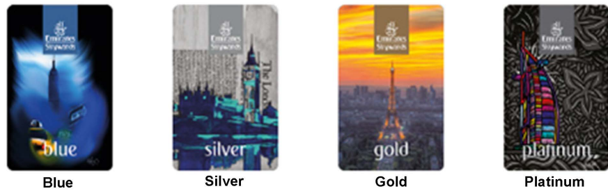
Figure 3. Rewarding membership tiers. Source: [9] [91].

covering every step from conception, creation and design to delivery, implementation, management, and support. A customer is central to EAs' strength in the airline market. Customers are the ones who reflect the good or bad services of the company, whether they are fully satisfied or disappointed. EAs offer customers all they need during its operations and processes, as well as on the flights themselves, to keep customers happy.