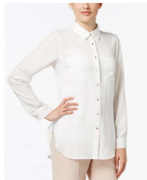
Figure A8. White plain long-sleeve.