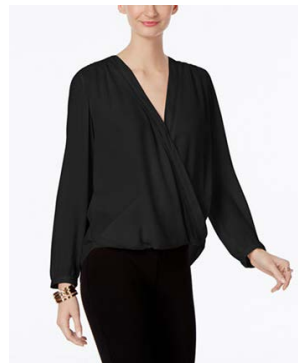
Figure A7. Black long-sleeve blouse.