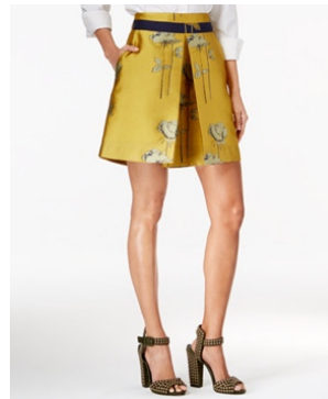
Figure B6. Yellow short dress.