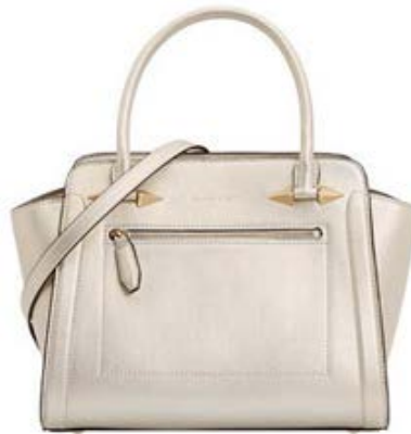
Figure A3. White handbag.