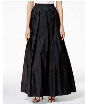
Figure A6. Long black wrinkle dress.