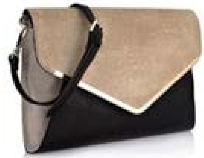
Figure B3. Brown/black handbag.