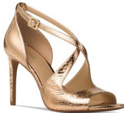
Figure B2. Golden heels.