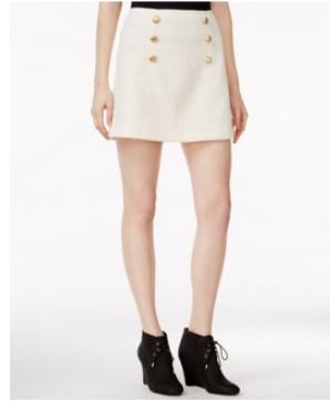
Figure B5. White miniskirt.