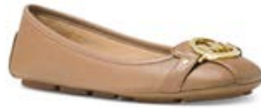
Figure A1. Brown flat shoes.

Less sexy and revealing fashion products used in the main study.