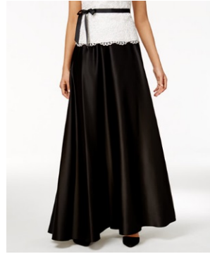
Figure A5. Long black silk dress.