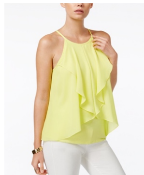
Figure B8. Yellow tank top.