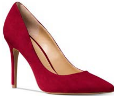
Figure B1. Red heels.

Sexy and revealing fashion products used in the main study.