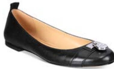
Figure A2. Black flat shoes.