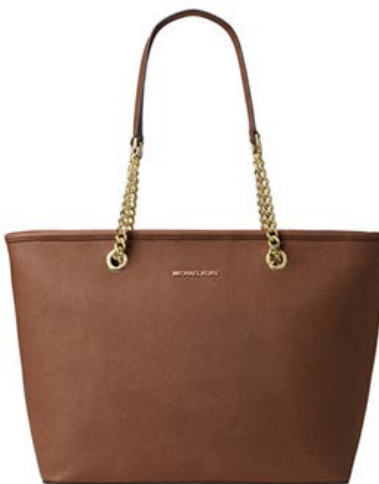
Figure A4. Brown/black evening clutch.