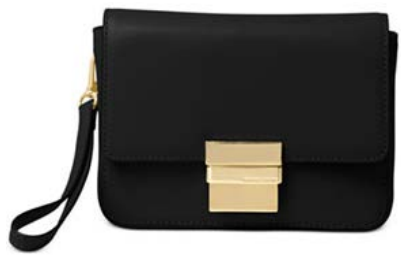
Figure B4. Black leather handbag.