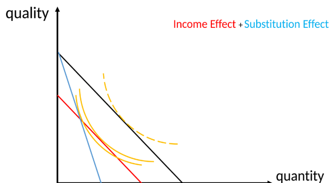
Figure 1. The effect of ad-valorem tax on a consumer's choice.