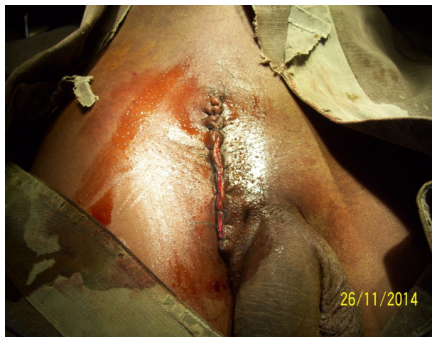
Figure 5. Final look.

The diagnosis is clinical and generally easy in the presence of pubopeneal swelling with an empty, hypoplastic homolateral bursa [7]. A case of antenatal diagnosis at 38 weeks of amenorrhea has been reported by Mazneikova [8]. Real-time ultrasound associated with colour Doppler may have prognostic value, detecting areas of trauma and exploring testicular vascularization [4].