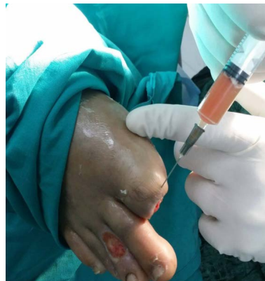
Figure 2. Injection of PRP.