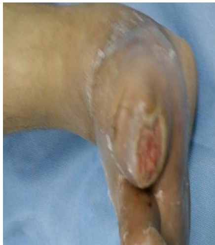
Figure 1. Fore foot ulcer.

In our prospective study, 73 patients were enrolled, 42 patients for group (A) and 31 for group (B). The ages were between 56 y and 61 y in group (A) but in group (B) the ages were between 51 y and 62 y. All the cases were type II diabetes. No significant association between the pre-existing medical condition and the distribution among the groups ( Table 1 ).