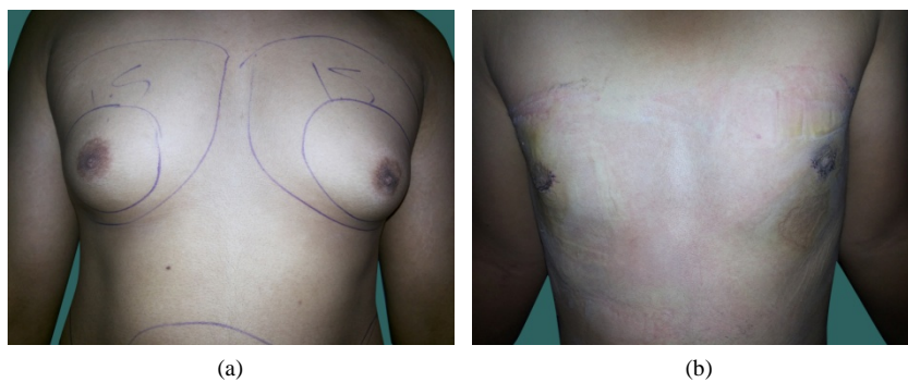
Figure 1. (a) Preoperative; (b) postoperative.