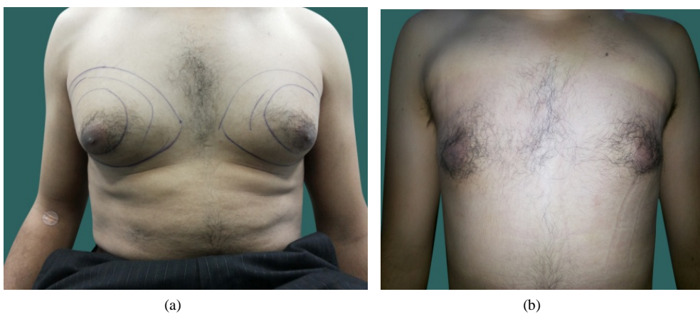
Figure 4. (a) Preoperative; (b) postoperative.