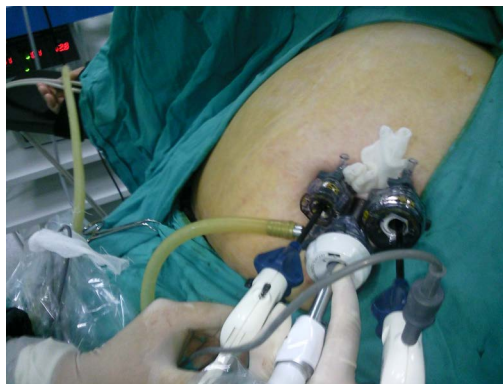
Figure 1. Position of trochars.

Note: C/S: cesarean section. History of cholecystitis “+”. DM: diabetes mellitus. BMI: body mass index.