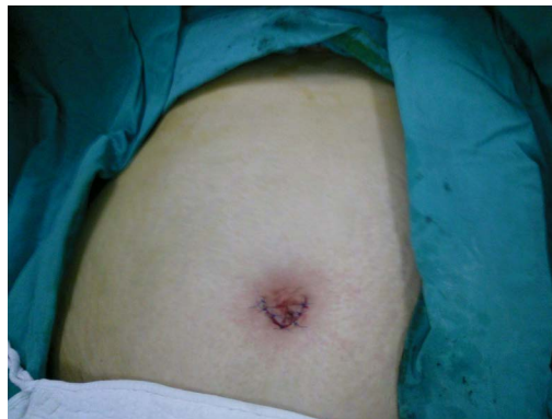
Figure 3. Postoperative view of incision.

improvements in SILS cholecystectomy. The technique and technology for this are still in their infancy but are making rapid progress. This procedure is a promising alternative method to shorten the learning curve, and is a safe and cost-effective SILS cholecystectomy technique, with scarless abdominal surgery, for the treatment of some patients with gallbladder disease with conventional instruments. Further studies need to be conducted comparing morbidity with that of traditional laparoscopy. Cosmetic outcomes are certainly excellent and may drive the overall use of this technology in the future.