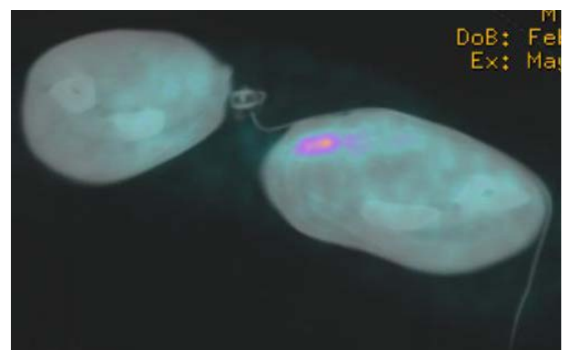
Figure 1. PET CT: Focal FDG uptake on the arteriovenous graft.

The patient was treated with total graft excision. No pus was found peroperatively and the prosthesis was well incorporated without anastomotic pseudoaneurysms. On the prosthetic loop, two aneurysms containing thrombus were found, according to the ultrasound.