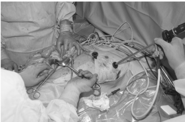
Figure 1. Operating picture of video-assisted thoracic surgery for multiple injuries. To perform an emergency concomitant surgery, a patient is generally placed in the supine position or semi-lateral position only of upper body.

The data are presented as means plus range or \pm standard deviations. The Wilcoxon test or the chi-squared test was used to compare data in the two groups using JMP5.1 statistical software (SAS Institute Inc, Cary, NC).