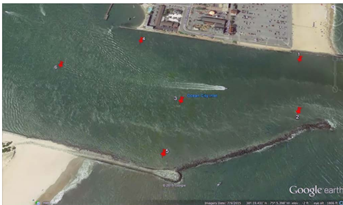
Figure 2. Zoomed in aerial view of the Ocean City Inlet with data collection sites indicated and their respective coordinates indicated (Source: "Ocean City Inlet", 38°19.431'N and 75°5.398'W, Google Earth, July 9, 2015, December 8, 2015). (1) N38°19.46', W75°05.19'; (2) N38°19.39', W75°05.23'; (3) N38°19.43', W75°05.39'; (4) N38°19.53', W 75°05.43'; (5) N38°19.37', W75°05.43'; (6) N38°19.51', W75°05.56'.

The most consistent and highest magnitude flow speeds occurred at 6.25 feet below the surface for all sites. Table 1 shows the average flow speed measured at a depth of 6.25 at each specific data collection site for each data collection trip. Seven total data collection trips were conducted. Data from one of the trips is omitted from Table 1 due to malfunctioning equipment during that specific trip. During trip #4, accurate data could not be captured at site 2 due to heavy and dangerous wave activity. Table 1 also shows the average depth at each collection site provided by the Garmin Fishfinder 34°C, the low tide and high tide times provided by NOAA, and the mean lower low water (MLLW) and the mean higher high water (MHHW) levels provided by NOAA.