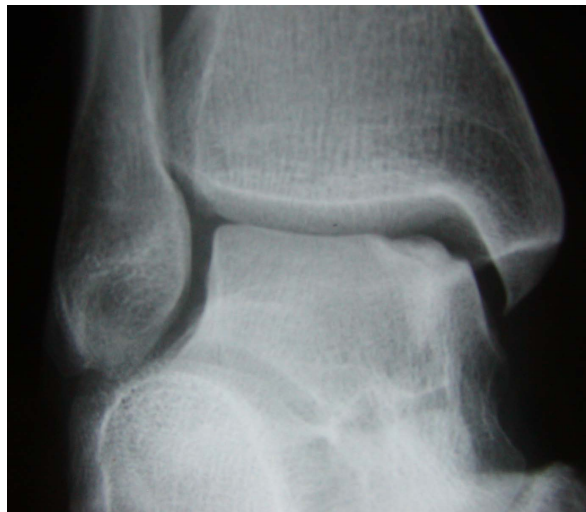
Figure 1. Osteochondritis dissecans of the medial talar dome pre-operatively.

The human amniotic allograft (HAA) used in this study is a commercial product that is composed of human amniotic membrane and cells from the amniotic fluid*. The cells from the amniotic fluid include multipotential stem cells that have been shown to be capable of differentiation into a variety of tissue types including bone, muscle, cartilage, and tendon, among others. Additionally these tissues are rich in various growth factors including morphogenic proteins, hyaluronic acid, collagen precursors and proteoglycans [25]-[28]. There is no an-