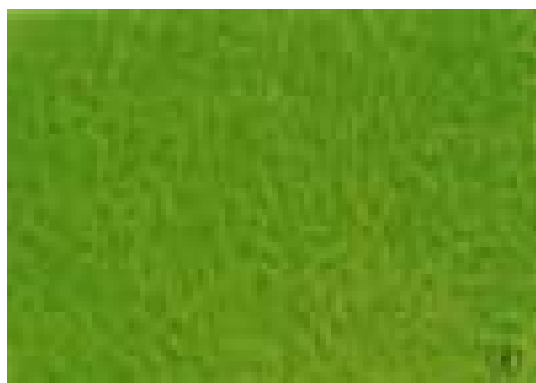
Figure 2. EPCs appeared the typical shape of cobblestone shape or slabstone.