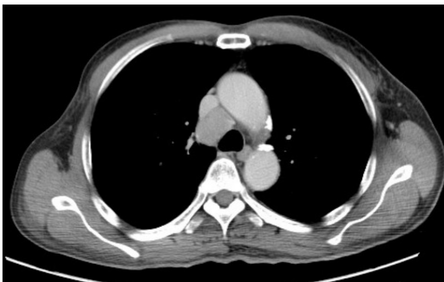
Figure 1. Computed tomography scan showing mediastinal lymph node adenopathy.

A 61-year-old man with dermatomyositis was referred to our hospital because of mediastinal lymph node adenopathy that had been detected by computed tomography (CT). The CT scan revealed a round, 3-cm-diameter mass in the upper mediastinum ( Figure 1 ). Whole-body positron emission tomography/CT revealed abnormal accumulation of substrate within the mediastinal tumor and greater curvature of the stomach ( Figure 2 ).