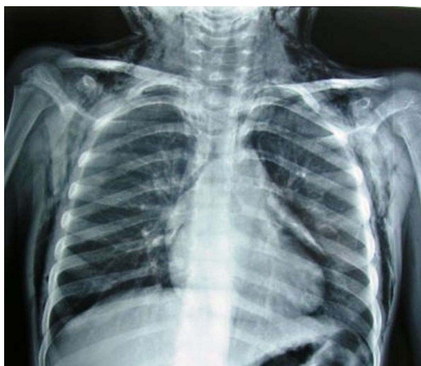
Figure 1. PA chest radiograph on the first admission; demonstrates subcutaneous emphysema both in cervical and thoracic regions.