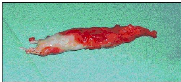
Figure 2. Macroscopic aspect of the thrombus after surgical removal. Organized and more recent thrombotic aspects can be detected.