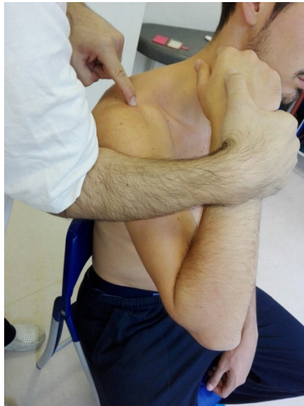
Figure 5. With one finger on the ACJ, the operator holds the patient's forearm with the other hand.

The ACJ is involved in the stabilization of the entire shoulder complex, enabling mechanical stresses to translate from the clavicle to the scapula and vice-versa [52].