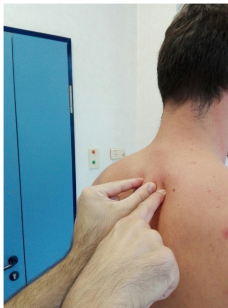
Figure 2. The D1 spinous process is held, while the free hand index leans laterally to the transverse process of the same vertebra; the patient is asked to make deep inhalations and exhalations, in order to allow the costovertebral joint palpation.

acromionclavicular joint [42]. The scapula, when unable to perform all movements, could cause a TOS syndrome [25]. The operator's hands hold the patient's shoulders and, with gentle movements, drag the scapula in the different directions (cranial, caudal, right and left, lateral and medial rotation) (see Figure 3 ).