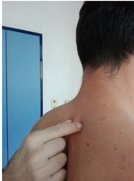
Figure 1. With the patient standing and the operator behind him, D1 spinous process has to be grab with the index and the thumb, producing delicate side shift movements.

and costotransverse joints [35]. Since they are innervated joints (by the sympathetic system and the lateral branches of the dorsal thoracic branches), they can be a source of pain in asymptomatic patients when stimulated, or produce pain in case of articular restrictions [35] [36].