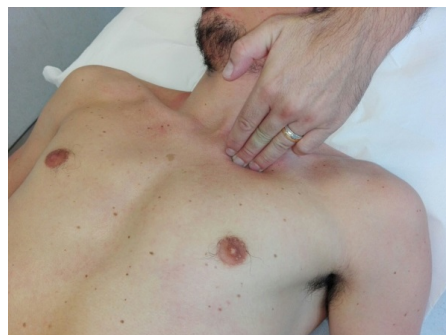
Figure 11. The evaluation of the subclavian muscle is simple: the operator's fingers are placed below the clavicle, particularly in the middle third of the bone, perceived as a small strip of compact tissue.