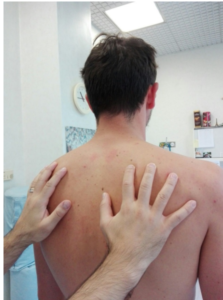
Figure 3. The operator's hands hold the patient's shoulders and, with gentle movements, drag the scapula in the different directions (cranial, caudal, right and left, lateral and medial rotation).