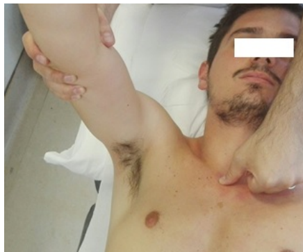
Figure 15. The thumb must be placed over the joint while the other hand grasps the patient's arm in the same way used for the evaluation of the clavicle; the patient's arm is flexed (to 90 degrees), inducing in the shoulder anteposition and retroposition.

For the middle scalene, the head bends to the left without rotations, respecting the functional anatomy of these two muscles [66] (see Figure 17 ).