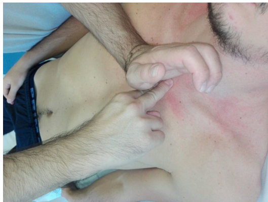
Figure 14. The hypothenar eminence must be placed on the manubrium with a slight perpendicular pressure, while the index and middle fingers are placed on the first two cartilages; the patient is asked to make a deep inhalation and exhalation, allowing to assess whether the ribs are able to move freely or if pain occurs.

For the sternoclavicular joint (SCJ), the thumb must be placed over the joint while the other hand grasps the patient's arm in the same way used for the evaluation of the clavicle; the patient's arm is flexed (to 90 degrees), inducing in the shoulder ante-position and retro-position (see Figure 15 ).