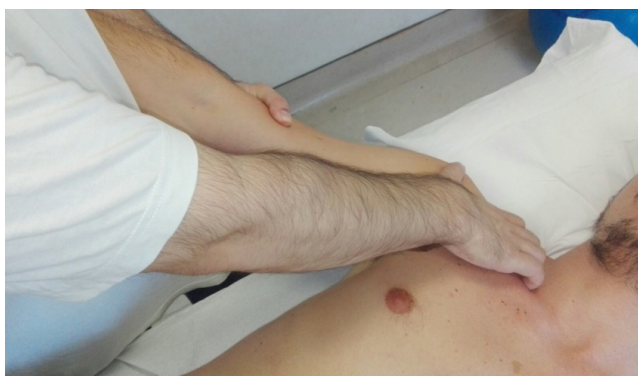
Figure 12. Circling of the clavicle are performed, in order to mimic the three-dimensionality of its axes of motion, while the hand is held on the clavicle to facilitate movements.

The scheme must be repeated for the opposite side. By blocking the manubrium the first ribs are forced to compensate for the restriction induced on the sternum, showing the potential presence of anterior hypomobility of ribs. If the ribs do not move properly anteriorly, the corresponding vertebrae lose their motion ability, resulting in pathologic conditions of the thoracic outlet [43].