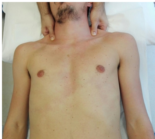
Figure 7. The operator’s hands grab the supraclavicular trapezius area, pulling the muscles towards himself.

In this way, the tone can be perceived and any abnormalities of the cervical-dorsal portion can be detected. The trapezius muscle is flat and wide, involving the cervical and thoracic spine, including the first two thoracic vertebrae, the ACJ and the posterior edge of the distal third of the clavicle [49]. The trapezius has a fundamental role in the movements of scapula and clavicle, which is brought back and raised during muscular contraction (especially with the abduction of the arm), due to the indirect action on the sternoclavicular joint [55]. An altered muscle tone may adversely affect the costoclavicular space; to know whether the muscle needs a reinforcement or inhibition could make the difference in the rehabilitation and conservative process.