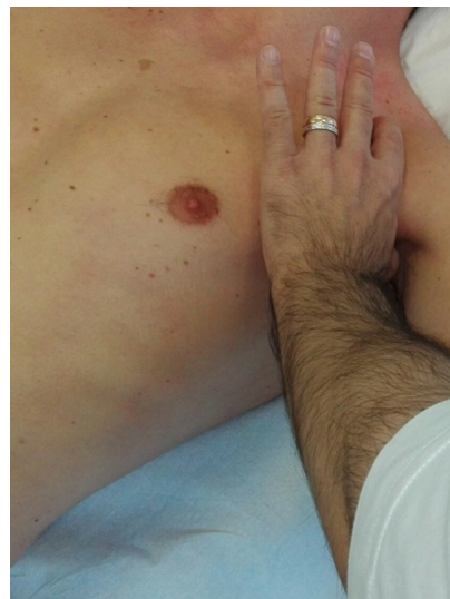
Figure 10. The thumb must be cranially pushed under the axillar region towards the coracoid insertion of the muscle, with oblique orientation.

This step is useful to understand the health status of the muscle; an altered tone or presence of pain can be a symptom of TOS [6] [59]. The evaluation of the subclavian muscle is simple: the operator's fingers are placed below the clavicle, particularly in the middle third of the bone, perceived as a small strip of compact tissue (see Figure 11 ).