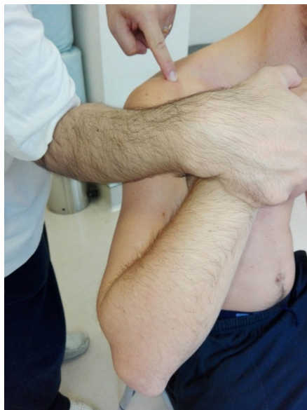
Figure 6. Internal and external rotations of the shoulder joint must be performed to verify joint compliance and consistency.