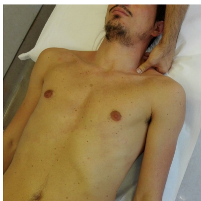
Figure 8. The first rib must be examined bilaterally, evaluating the posterior area of the neck with the fingers until the neck base; the medial aspect of the first rib is perceived as a hard formation which varies its position according to the breath.

The operator is standing next to the patient supine, and the evaluation goes on. A portion of the brachial plexus can be palpated, especially in the supraclavicular area. The patient's head can tilt towards the other side (not palpated), while the operator looks for the subclavian artery at the level of the middle third of the clavicle; a portion of the plexus can be evaluated over the subclavian artery and laterally to the anterior scalene muscle [7] [56] [57] (see Figure 9 ).