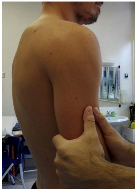
Figure 4. The operator holds with his hands the middle third of the arm, and poses a slight downward traction, evaluating the tissue resistances.