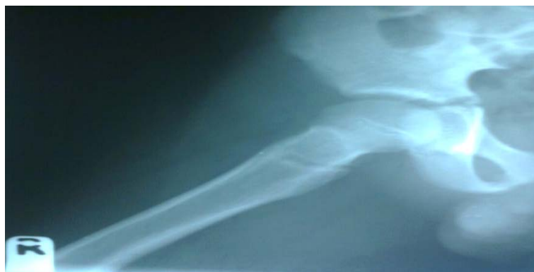
Figure 1. Marker within the primary radiation field with obstruction of non-essential anatomy.