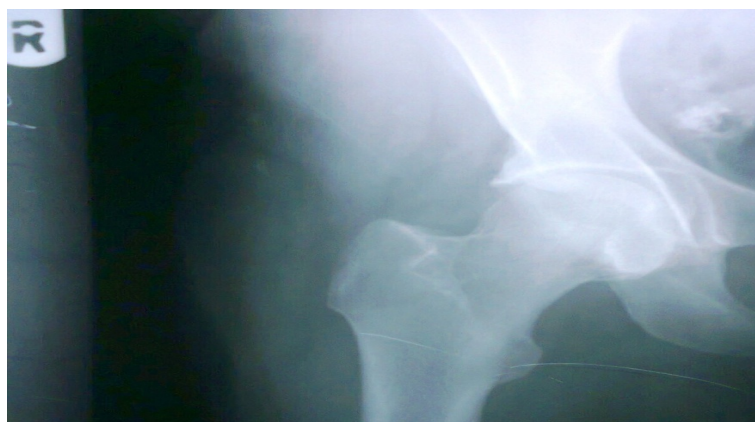
Figure 3. Marker placed in secondary radiation field.