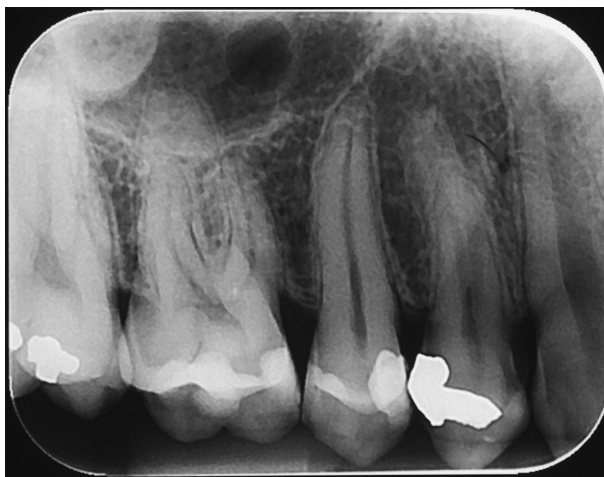
Figure 1. Periapical radiography. Note a radiolucent, unilocular, well-defined, overlapping the maxillary sinus, with no relation to upper right posterior teeth (16 and 15).

The axial, sagittal and coronal planes revealed the presence of maxillary sinus extension into the alveolar process toward the palatal cortical bone near the maxillary right first molar. Additionally, the antral septum extended from the inferior and lateral wall of the right maxillary sinus ( Figure 2 ), which ruled out any possibility of cystic lesions in the maxillary sinus. The patient was given the diagnosis of an antral septum with extension of the maxillary sinus into the alveolar process. The different planes of images and knowledge of sectional anatomy were essential to make the diagnosis.