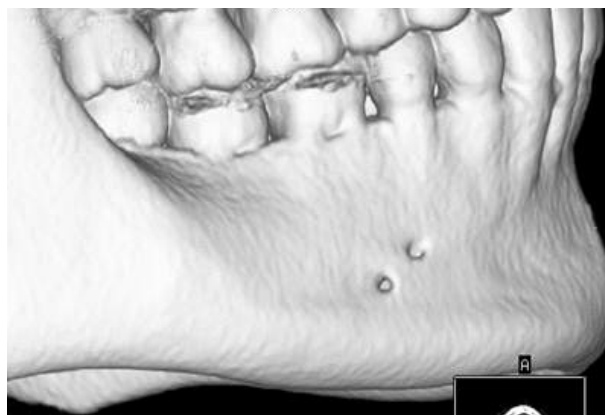
Figure 2. Three-dimensional reconstructed CT image showing the accessory mental foramen in the right premolar region.

concave because of the submandibular and sublingual fossae, which appear radiolucent. Further, the mental and accessory mental foramens mimic radiolucent lesions. Finally, the long axis of the accessory mental foramen in the presented case was 2 mm, longer than the standard length [4] [8].