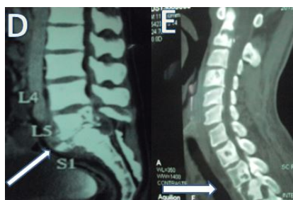
Figure 2. CT scan showing C1 - C2 spondylodiscitis, C4 and T1 spondylitis and a spondylodiscitis at the level of T2 - T3 (E) and L5 - S1 with an epidural abscess (D) (patient 2).

A 21-year-old man, who had a contact with lung tuberculosis one year and 6 months before, was hospitalized for bilateral chronic thoracolumbar radiculalgia of progressive occurrence, badly systematized, of inflammatory character and which became progressively disabling. This symptomatology was associated to a chronic productive cough sometimes hemoptoic in the context of fever, progressive weight loss and night sweats. Physical examination revealed a marked thoracolumbar spinal syndrome: spinalgia on palpation, lumbar hump and multidirectional stiffness with Schöber index at 10 + 0 cm. A pyramidal irritation syndrome (presence of babinsky sign, sharp tendon reflexes in the 4 limbs) was noted without motor deficit. In biology, the ESR was 60 mm and CRP at 178.24 mg/l. The tuberculin skin test was positive at 18 cm. The search of acid-alcohol fast bacilli in sputum and HIV serology were negative. CT scan of cervicothoracic and lumbar spine respectively brought out spondylodiscitis at the levels C3 - C4, from T5 to T9 and from L3 to S1, with epidural and soft tissues abscesses ( Figure 3 ). A probable multilevel cervicothoracic and lumbar spine tuberculosis was retained as diagnosis. Anti-tuberculous treatment was established for 12 months (2 months RHZE following by 10 months RH) and spinal immobilization gave satisfactory results.