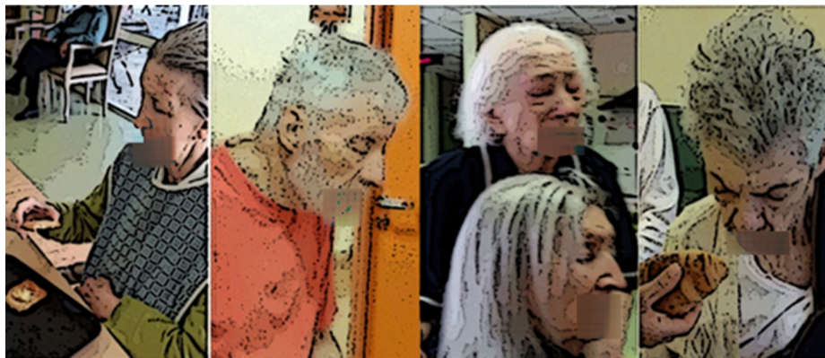
Figure 3. One of the consequences of failure of the phatic function: Regression.

an act of mutual identity giving [22]. For it to materialise, the availability of each person involved is indispensable. Alzheimer-patient identity break-down is linked to cognitive troubles and to the failure of the patient's attempts to enter into a relationship.