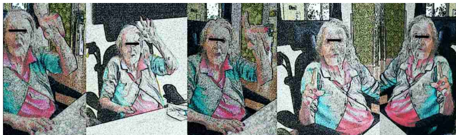
Figure 2. The phatic function in Alzheimer's disease.