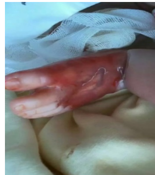
Figure 1. The newborn presented with the skin defect of the left foot on day one.

Figure 2 shows after the age of six weeks, ongoing healing with secondary intention, but at the age of 16 to 18 weeks wound healed with a small crust ( Figure 3 ) and finally at the age of 5 month showing the complete secondary healing of