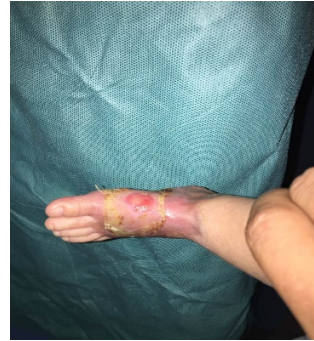
Figure 3. At the age of 16 - 18 weeks the wound healed with a small crust remaining.

the aplasia cutis Congenita defect ( Figure 4 ). Figure 5 shows the images of “Skin Biopsy”: From ulcerated lesion.