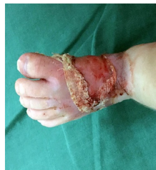
Figure 2. Six week postnatally, showed on-going healing by secondary intention.