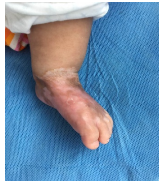
Figure 4. At the 5 th months, showing the complete secondary healing of the aplasia cutis congenita defect.