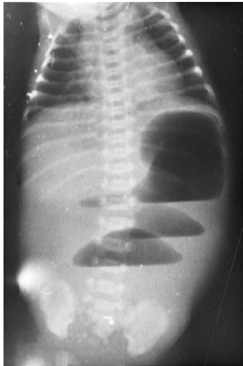
Figure 1. Showed multiple air-fluid interphases.

Resection of the close loop bulbous part with the volvulus insitu and end to end anastomosis. The patient had uneventful recovery with no complication 2 years after ( Figure 5 ). Consent to publish this case report was obtained from the parents, which was gladly given to promote medical knowledge.