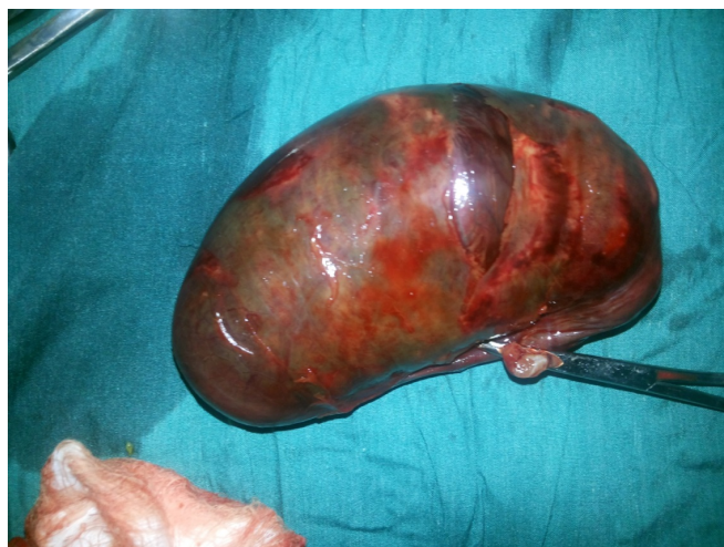
Figure 4. Showing the resected terminal dilated proximal ileum.