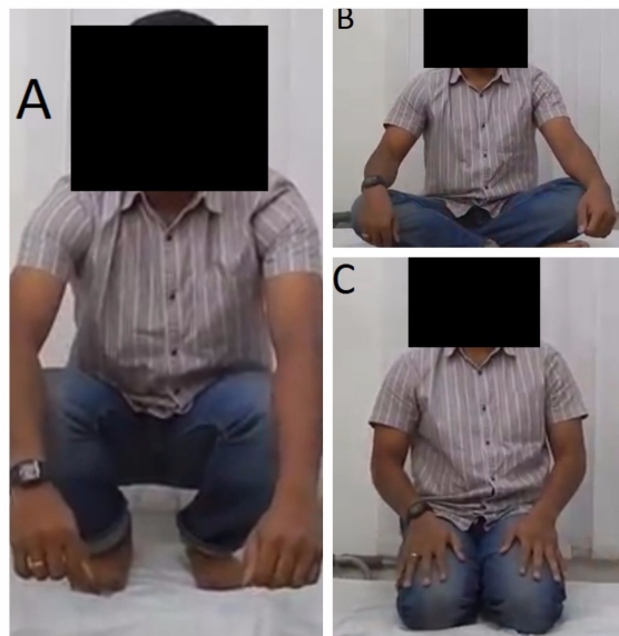
Figure 5. (a) Photograph of a representative study patient in squatting position, (b) in cross-legged sitting position, (c) in kneeling position.