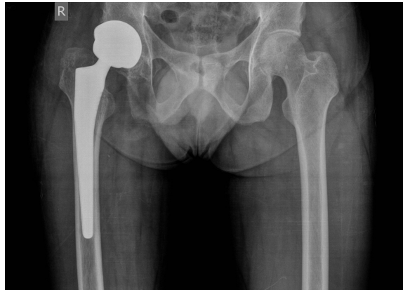
Figure 3. Radiograph AP pelvis at 1 month post surgery with DeltaMotion prosthesis.