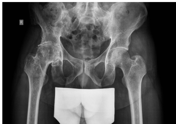
Figure 2. X ray AP pelvis of representative case—pre-operative.