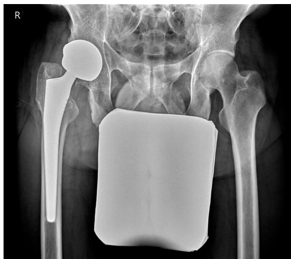
Figure 4. Radiograph AP view pelvis at 5 year post surgery with DeltaMotion prosthesis.